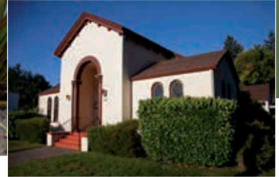
Ukiah Office: 204 South Oak Street