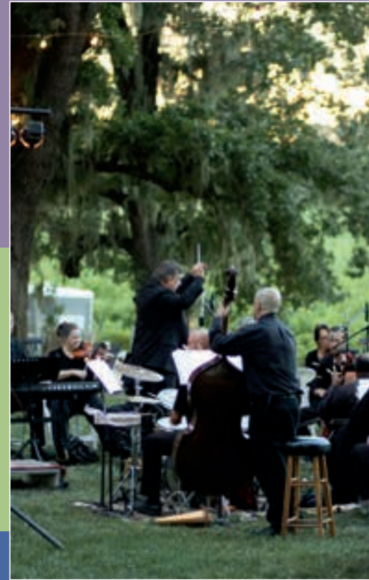
Ukiah Symphony Orchestra

Alex Rorabaugh Center Ford Street Project, Inc. Mendocino County Youth Project Redwood Valley Outdoor Education Project School of Performing Arts and Cultural Education (SPACE) TLC Child & Family Services Ukiah Symphony Orchestra