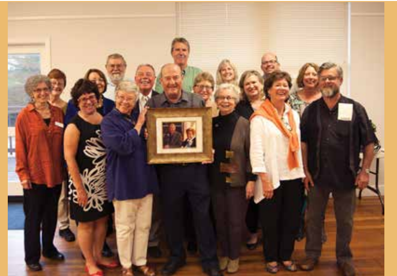
A reception was held to honor the organizations receiving grants from the Bishoff Funds